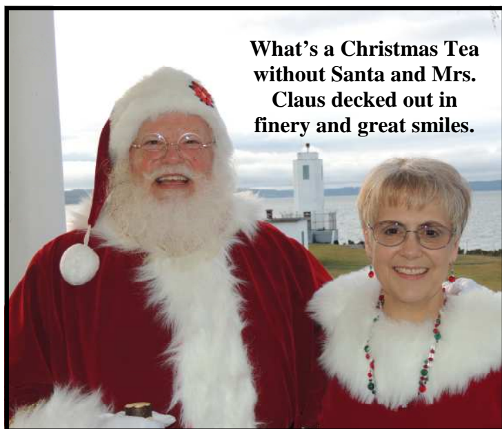
What's a Christmas Tea without Santa and Mrs. Claus decked out in finery and great smiles.